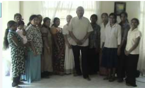
Batticaloa, Sri Lanka