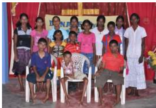
Canaan Children's Home, Badulla, Sri Lanka