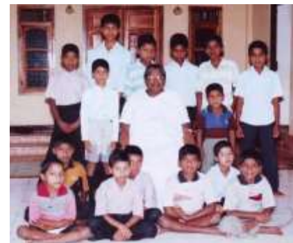
Bethany Children's Home, Anaicoddai, Jaffna, Sri Lanka